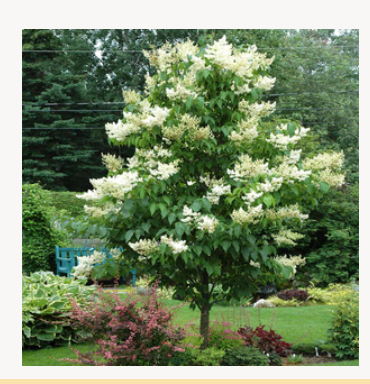
Ivory Silk Japanese Tree Lilac